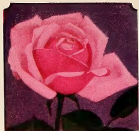
★ Radiance. 75c

With fall-planted Roses, the roots become established during the winter; in consequence, these plants will produce more and better blooms the following spring, summer, and fall. So sure are we of the benefits of fall planting that we unreservedly guarantee every Star Rose planted this fall to live through the winter and bloom at its first natural blooming period, or we will replace it free. You run no risk.